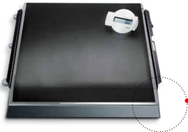
A ramp for easy roll-on of wheelchair is included in delivery.