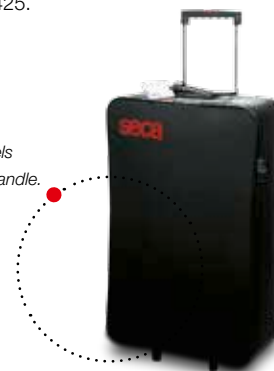
With plastic wheels and retractable handle.