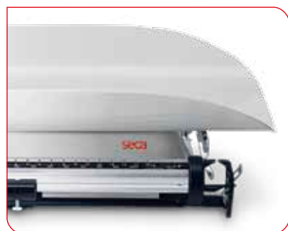
To simplify cleaning, weighing tray can be removed.

The weighing tray is easy to remove from the base for cleaning. The hard-wearing, scratch-proof finish and the smooth, seamless surface makes the seca 745 extremely easy to clean. The scale can be safely stored and is easy to transport in the optional carrying case seca 425.