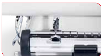
The reset-to-zero function guarantees reliable determination of net weight by simply deducting the extra weight of padding or diaper.