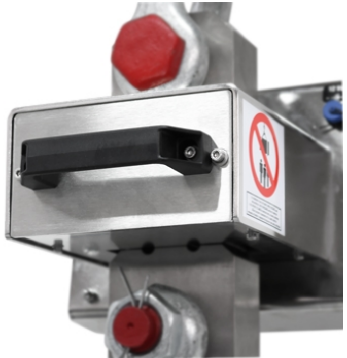
Crane scale MCW09: extractable battery view