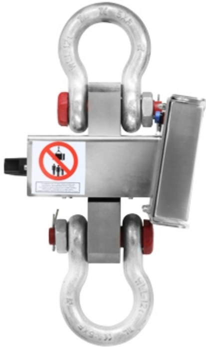
Crane scale MCW09: side view