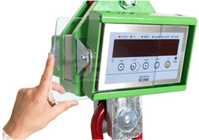
Protective screen in plexiglas for display and keyboard.