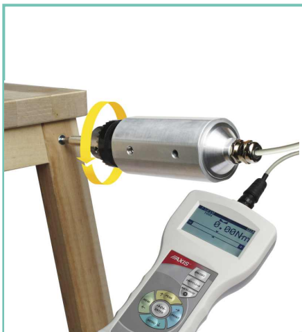
Measurement of the "strength" needed to unscrew