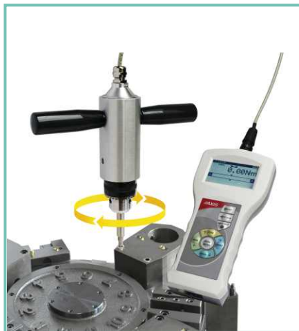
Tightening the screw with precisely defined "strength"