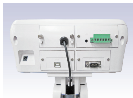
Display unit with HVW-02CB, HVW-03C, and HVW-04C

* 7 For communication with a PC only. The driver software can be downloaded for free.