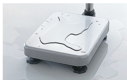
IP65 base unit with a SUS430 pan

The base unit can be washed with water, not to mention that wet objects can be weighed with no problem. Further, the surface of the pan is resistant to chemicals, scratches and rust, and easy to keep clean and hygienic.