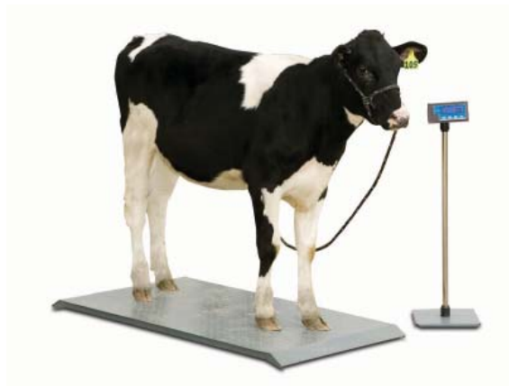
PS2000 shown with optional indicator stand

PS1000: 816965001460 PS2000: 816965003907