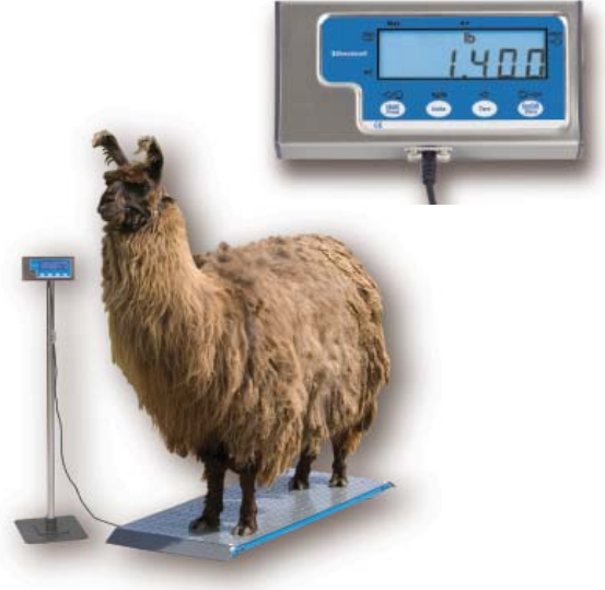
PS1000 shown with optional indicator stand

Operating Temp: 5° C to 35° C / 41° F to 95° F