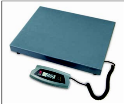
Now also available with larger plate