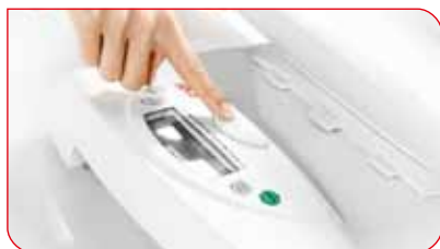
The weighing tray can be removed quickly and easily at the touch of a button.