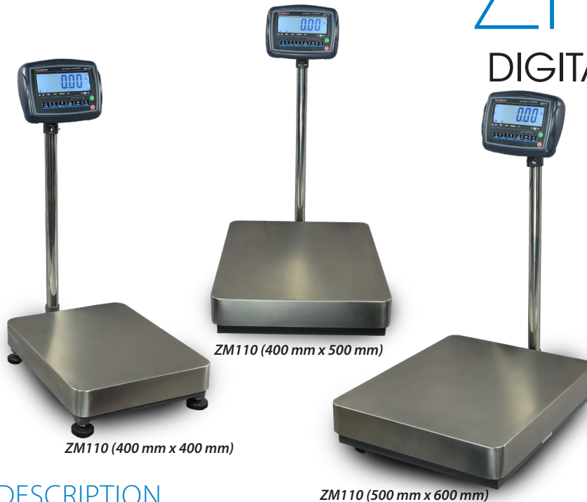
ZM110 (400 mm x 400 mm)