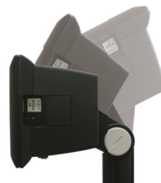
Tilting indicator bracket