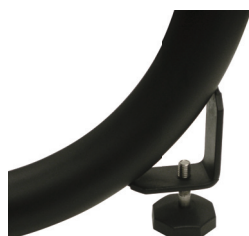
Additional pole-support foot