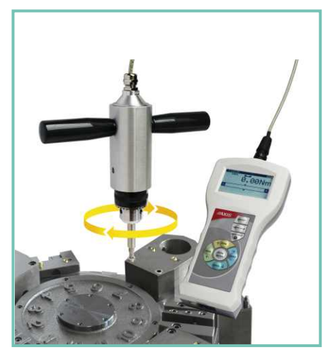
Tightening the screw with precisely defined "strength"