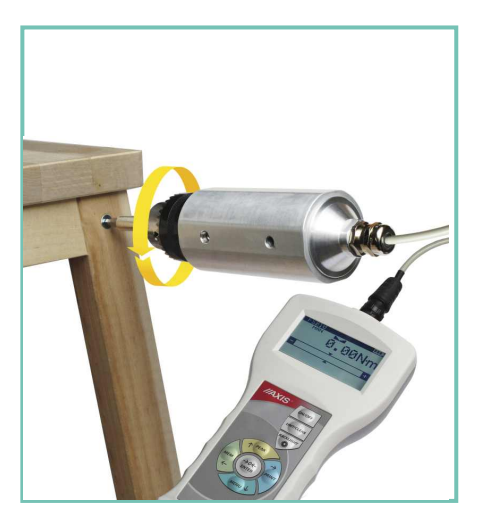
Measurement of the "strength" needed to unscrew