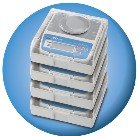
Stackable Carrying Case (Standard)