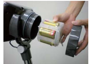
Easily removable battery unit