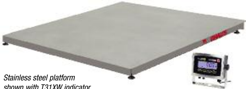
Stainless steel platform shown with T31XW indicator