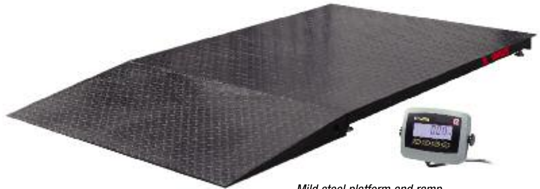
Mild steel platform and ramp shown with T31P indicator